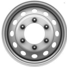
16" Silver Steel Wheel with exposed lugnuts Standard on DRW Cargo Van & Passenger Wagon models