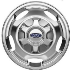
16" Forged Alloy Optional on all DRW models