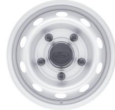
16" White Steel Wheel with Mini-Cap and Lug Nut Covers Optional on all SRW models (Fleet only)