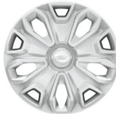
16" Steel with Full Black/Silver Wheel Cover (SRW). Standard with XLT Passenger Wagon. Optional for Cargo Van, Cutaway, Chassis Cab and XL Passenger Wagon. Included with Exterior Upgrade (SRW)