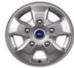
16" Easy To Clean Styled Aluminum Alloy Wheel (SRW). Optional