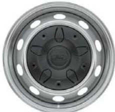
16" Painted Steel Wheel with Black Center Hubcap (SRW) Standard on All SRW Models (Excluding XLT Passenger Wagon).